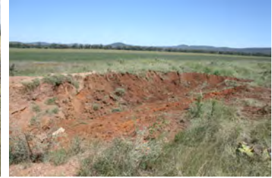
After (with more work to be done...)